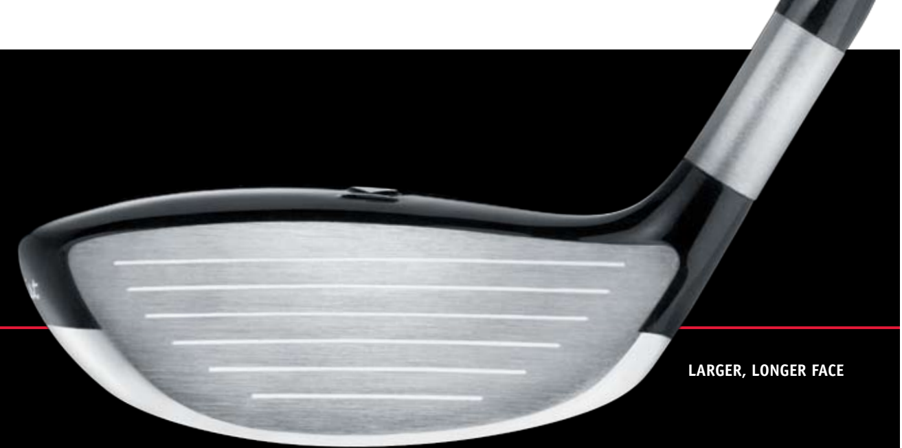
LARGER, LONGER FACE

A progressive fairway wood shaft using multi-materials to promote a tour preferred, neutral ball flight for maximum control and workability.