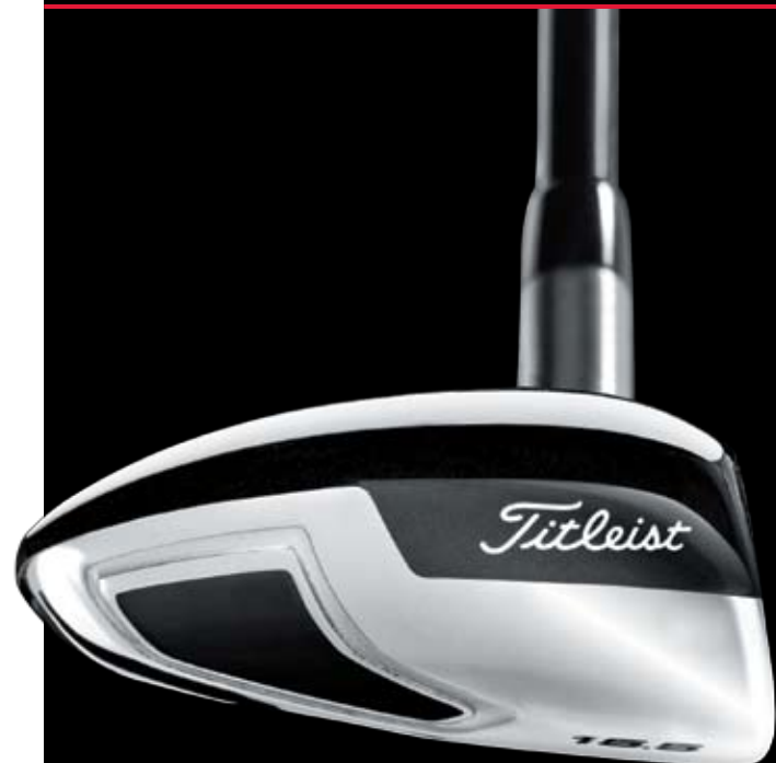
MULTI-RELIEF SOLE DESIGN