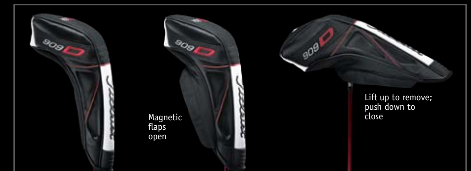
HEADCOVER WITH MAGNETIC CLOSURE FOR EASY-ON, EASY-OFF INSTALLATION